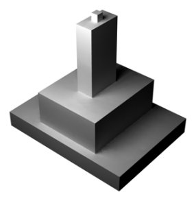
Figure 2: Tower of Babylon

You receive 10 points for a correct answer, and 0 points for an incorrect answer.